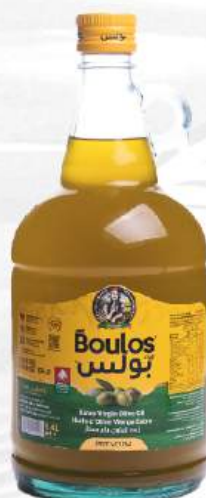
BOULOS Premium EVOO 1.4 L Glass Gallon