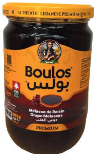
BOULOS- Grape Molasses 800g