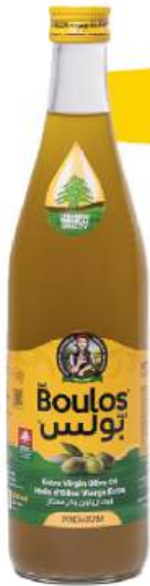
BOULOS Premium Extra Virgin Olive Oil Traditional Classic