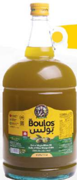
BOULOS Premium Extra Virgin Olive Oil Traditional Classic Gallon