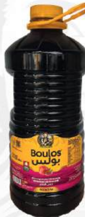
BOULOS-Premium Pomegranate Molasses 3L Glass Gallon

Pomegranate is rich in antioxidants. It's not just delicious, it's incredibly healthy. Elevate your meals with the rich, authentic flavor of this perfect blend of tradition and innovation. Boulos On the Go brings a taste of gastronomic excellence to your on-the-go lifestyle.