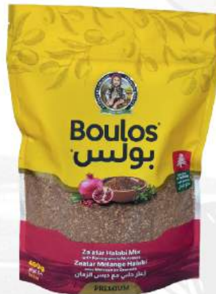
Boulos Za'atar Halabi Mix with Pomegranate Molasses 400g Net Weight - BAG