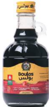
BOULOS-Premium Pomegranate Molasses 250ml Glass Gallon