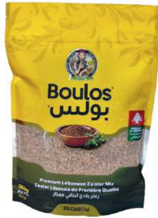
Boulos Thyme Extra 'Zaatar'-Lebanese 350g Net Weight - BAG