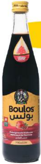
BOULOS-Premium Pomegranate Molasses 500ml Glass Bottle