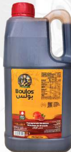
BOULOS-Premium Pomegranate Molasses 2L Glass Gallon