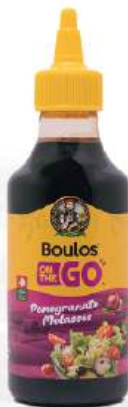
250 ML ROUND PET SQUEEZABLE BOTTLE