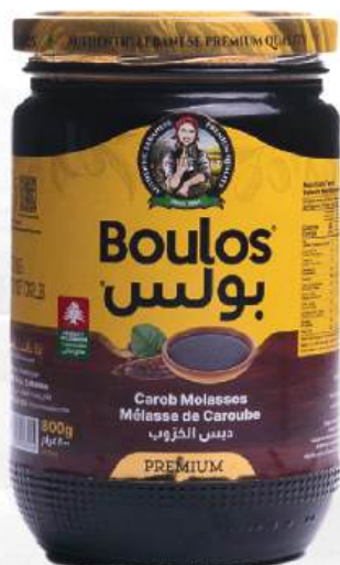
BOULOS- Carob Molasses 800g

Crafted from 100% pure grapes, our Grape Molasses is a naturally sweet, thick syrup with a rich, fruity depth. Its smooth texture and bold flavor make it a perfect addition to a variety of recipes—from traditional dishes to modern creations. A timeless ingredient that adds warmth and richness to every bite.