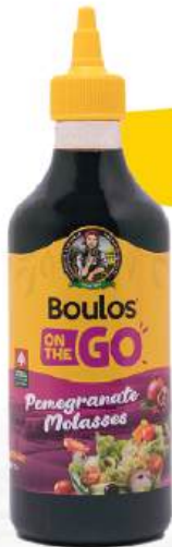
470 ML ROUND PET SQUEEZABLE BOTTLE

Boulos Pomegranate Molasses - Dressing is a unique type of Middle Eastern dressing made from pomegranate juice. The result is a tangy, sweet and tart flavor that makes a great addition to green salads as well as to your favorite Lebanese dishes such as "Fatouch (Lebanese Salad)" or "Lahm B'3ajeen (Meat Pie)". It is also a delicious relish with grilled poultry, meats, birds, or fish.