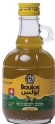
BOULOS Premium EVOO 250ml Glass Gallon