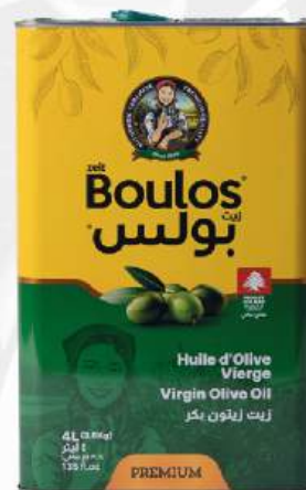
Boulos Huile d'olive vierge 4L